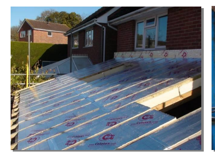
Figure 1A view of Rob's roof insulation during renovations