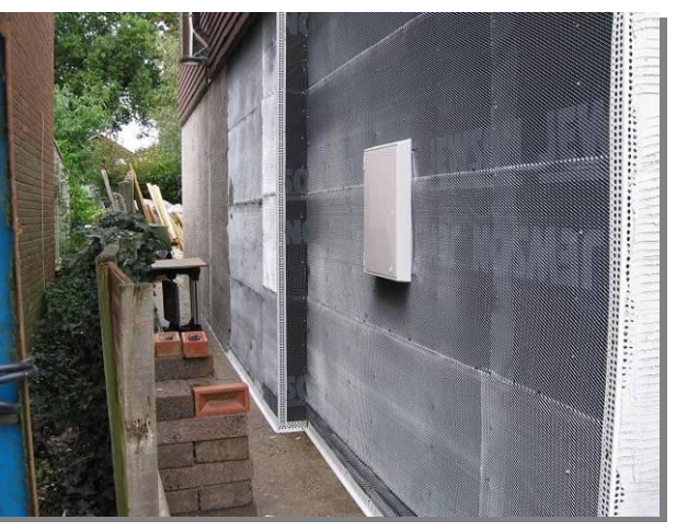
Figure 2Insulation being applied to the walls