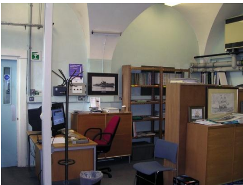
A small part of the paper archives

The additional rooms on the lower ground floor will house a history of word processing, from the typewriter to the DisplayWriter, and Personal Computing. We already have working models of the IBM-PC, PC-XT, PC Portable (aka Luggable!) and some PS/2s ready for display, and some old PC games to run on them. We also hope to receive in the near future an original data processing installation, consisting principally of an IBM 702, from the Army Pay Corps, Worthy Down.