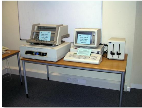
PC-RT, 3101, 3102, PS2s