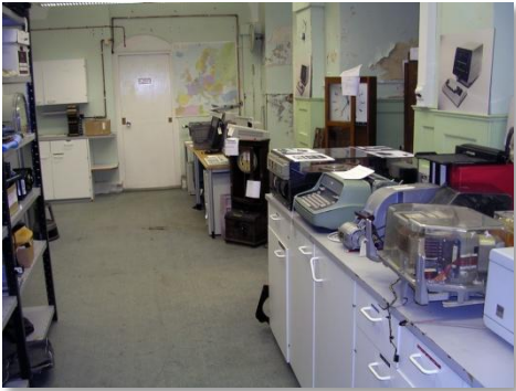
Reserve Collection Area

Our three curators have been busy since the last newsletter, bringing a number of old machines to life, receiving some useful artefacts including an expanding collection of different ThinkPads and more CE tools and supplies. We are expanding into new rooms on the lower ground floor of the House, which will soon be opened for visitors in addition to the existing museum facilities. We have also made a start on the mammoth task of cataloguing the collection. Using web technology we are hoping eventually to make the catalogue available to museum visitors.