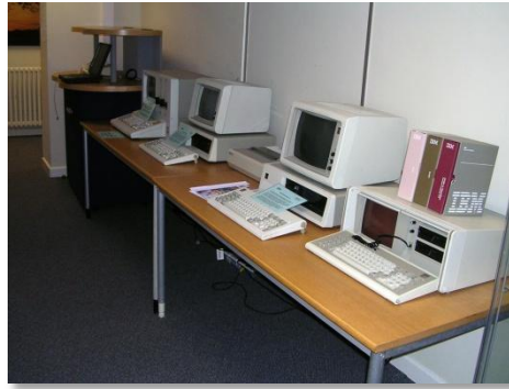
New Room with PCs and S/23

The additional rooms on the lower ground floor will house a history of word processing, from the typewriter to the DisplayWriter, and Personal Computing. We already have working models of the IBM-PC, PC-XT, PC Portable (aka Luggable!) and some PS/2s ready for display, and some old PC games to run on them. We also hope to receive in the near future an original data processing installation, consisting principally of an IBM 702, from the Army Pay Corps, Worthy Down.