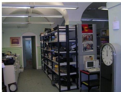
Part of the reserve collection area