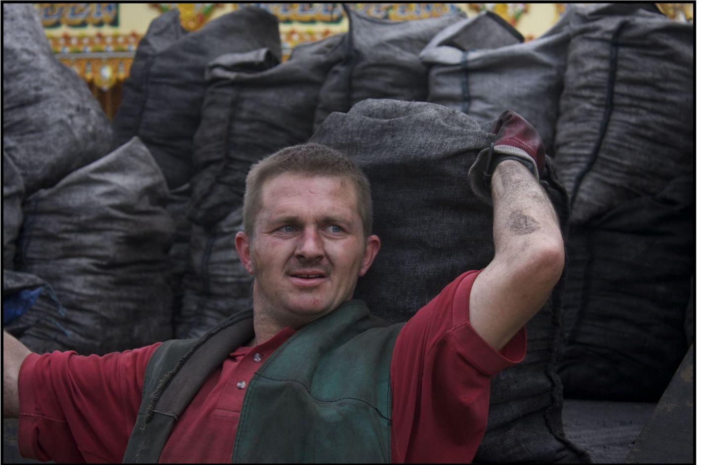
Man with coal

I love that it is almost monochrome apart from the red of his T-shirt. It is uncluttered so the eye goes straight to the man's determined face and the grit of his work. There is also a very strong diagonal composition line.