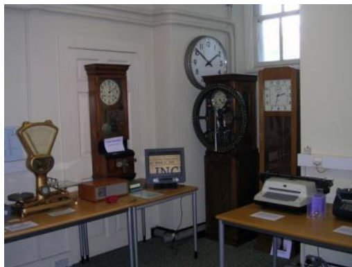
Two of the museum's rooms