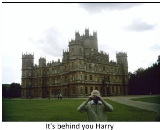
It's behind you Harry

It was a sunny day with a cold wind when 3 coaches left Hursley for the visit to Highclere Castle. First stop was at Newbury for a couple of hours free time and coffee/lunch before the short journey across to Highclere Castle.