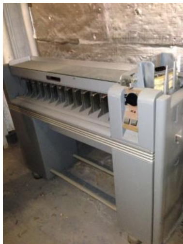
082 Card Sorter