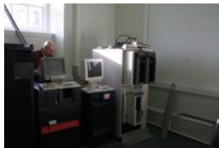
AS/400s & Tape Library

The Hursley DPMR kit is not particularly old, but we figure it will be one day. Included is a Power5+ server, comprising 8 x 2 way 2.2 GHz CPU cards, 16 x 4Gb DIMM, 16 x 73Gb 10K RPM SCSI disks and 8 x 2GB Fibre Channel PCI-X cards.