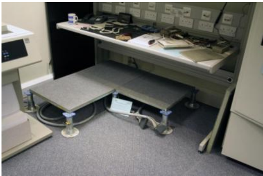
Raised Floor under CE workbench

The Customer Engineering work benches have acquired some additional lighting. A section of raised floor has been added to the display, with some channel cables underneath. Many of the machines on display have now been PAT tested, and can be demonstrated in working order.