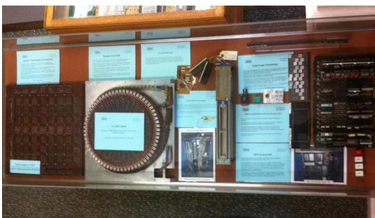
Mainframe 50 Display

To commemorate the 50th anniversary of the mainframe, the museum has put together a small display of artefacts in the "History of Hursley" room. These are the only items we have from S/360, and we were able to loan them to Barclays for a few days in May for their Mainframe 50 celebrations. We have also added a new page to the museum web site at http://hursley.slx-online.biz/mainframe.asp .